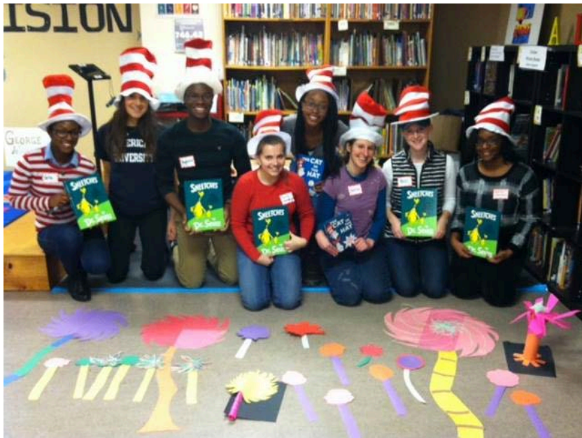
AU CCES Facebook, 2015