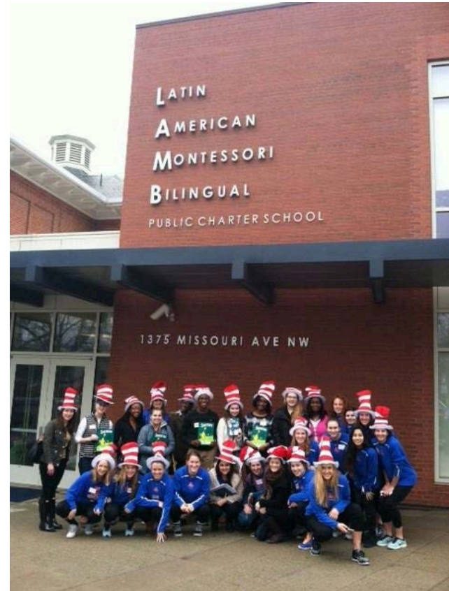
AU CCES Facebook, 2015