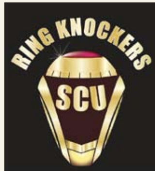
Ring Knockers is the SCU engineering alumni network.

Read all about it here: www.scu.edu/engineering/enews/2010winter/rk.cfm