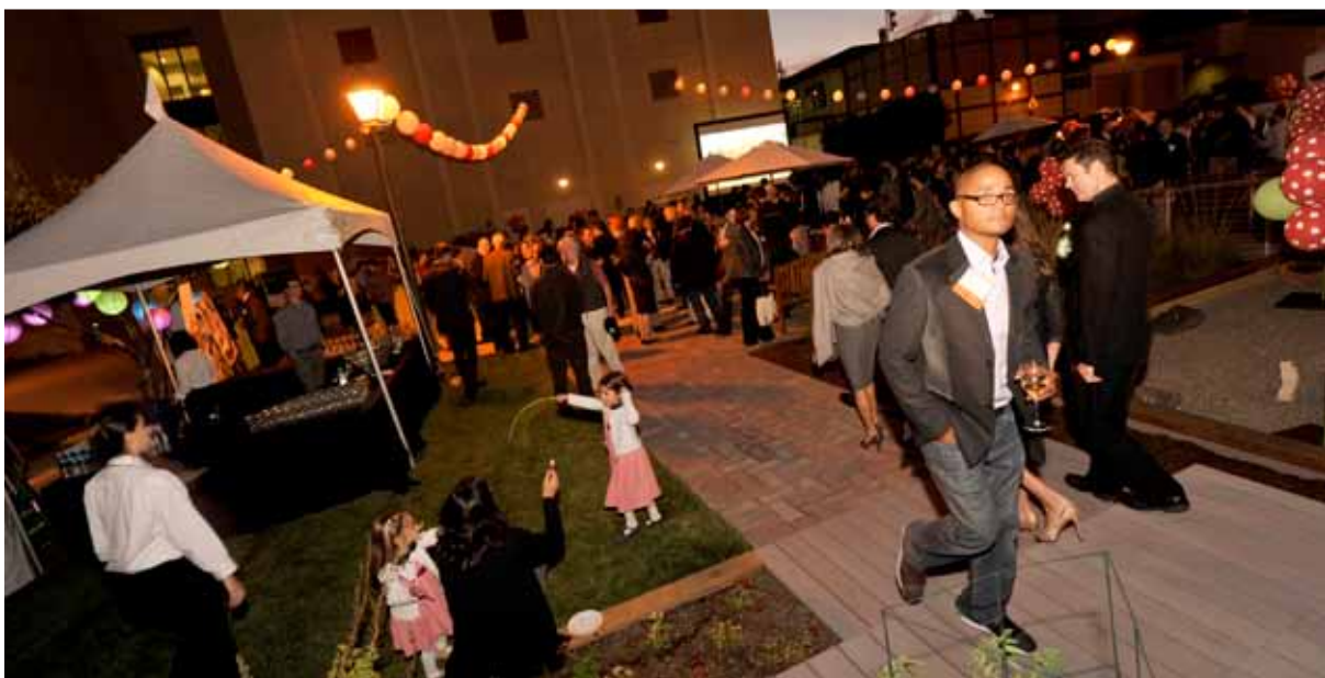
Hundreds of alumni, faculty, and friends celebrated the School of Engineering Centennial at The Biggest Bash Ever! in October.