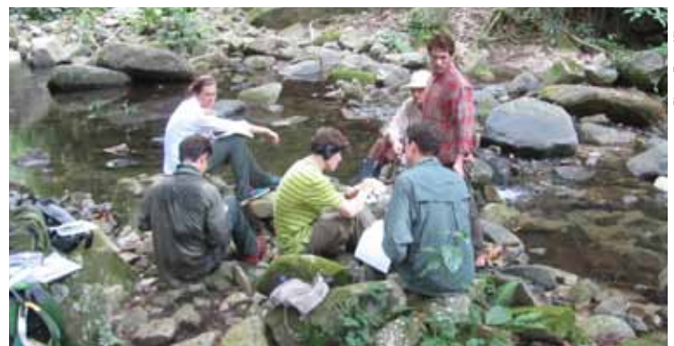
Site visits are an important part of the design process.

For more information on how to support the SCU student chapter of Engineers Without Borders, visit www.facebook.com/ewbscu .