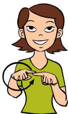
Figure 2: A teacher drawing a circle in the air when describing circumference to students.

It is hardly surprising that students feel that mathematics is inaccessible and uninteresting when they are plunged into a world of abstraction and numbers. This is particularly ironic when a different teaching approach of visual, creative mathematics - is available to all teachers and learners ( https://www.youcubed.org/week-of-inspirational-math/ ). Mathematics classes in the US do not reflect the knowledge we have of the importance of visual mathematics approaches, as most curriculum standards and published textbooks do not invite visual thinking. Many textbooks provide pictures but these are often irrelevant to the mathematical ideas presented. The Common Core pays more attention to visual work in the K-8 standards, than