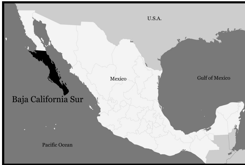
Figure 1: Location of Baja California Sur, Mexico.

While the park itself has achieved recent successes, the community of Cabo Pulmo still faces many internal social, political, economic, and infrastructural problems. The park receives national and international support and attention, but most of the local Mexican residents 2 still lack many basic resources such as public water infrastructure, power, health services, schools, and even clearly defined public spaces (see Gerber 2008; Gámez and Montañó 2004). The roads are unpaved. The nearest health clinic is at least 30 minutes away—and longer if the roads are washed out. The small elementary school was destroyed in 2005 when hurricane John swept through the peninsula. All that remains is an empty, forlorn concrete shell out on Cabo Pulmo point. There is a pre-school, but the rest of the community's young students take a forty minute bus ride into the neighboring pueblo of La Ribera. As for water, while the expats have plenty (although it's not cheap), the Mexican community has been fighting to make the government build reliable water infrastructure. While the national park has received considerable government attention and support, the needs of the local community lag far behind. Some members of the community, however, are pushing back...using discourses about sustainability as primary modes of social organization.