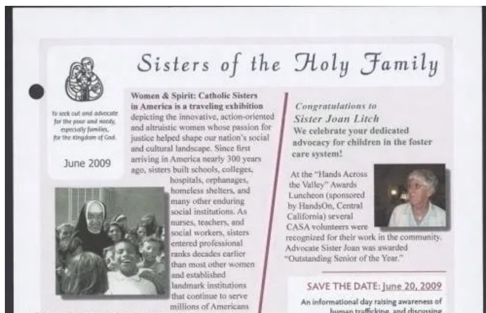
Image from the Sisters of the Holy Family Newsletters (1931 to 2017) on SCU Digital Collections.