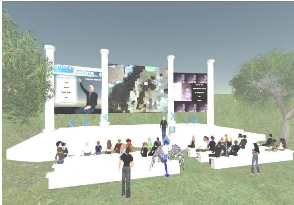
Figure 4. A collection of ‘residents’ attend a talk in Second Life of the Future Salon Network. Many class room and discussion spaces inside Second Life are clearly modelled on real-world discussion spaces. Compare against figure 2.

tools built into the system. The SL client includes an editor/compiler for writing scripts in the game's "Linden Scripting Language" (LSL). This allows the residents themselves build collaborative tools, whereas in a regular MMO game, company developers manage all features.