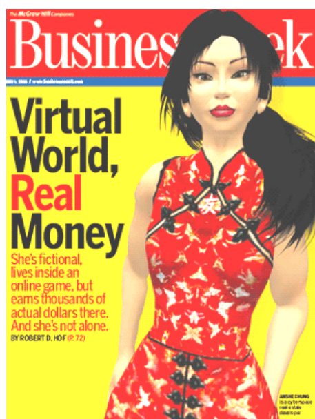
Figure 3. Business Week May 1 st 2006. Cover feature article includes interviews with a number of people who have built real businesses inside the virtual world of Second Life.

The most exciting difference between SL and traditional, themed role playing games is the scripting