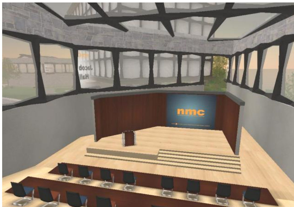
Figure 7. New Media Center's beautiful lecture hall sits empty.

The current phase of this technology seems very similar to the early days of cinematography. Artists in the early part of the last century used their new technology to create duplicates of existing dramatic works. They translated their existing models directly and without concern for the new abilities of their equipment. It will take time before the artists in this new 3D medium will do more than the equivalent of building platforms in a live audience theater production to film uninterrupted plays.