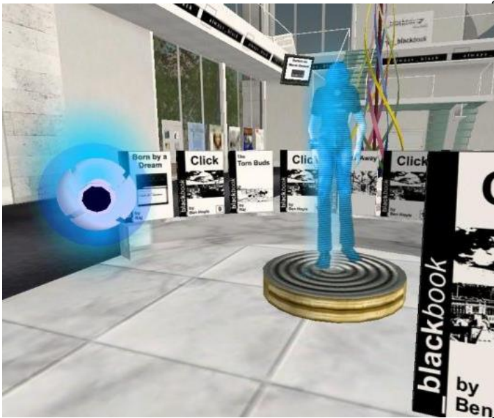
Figure 6. A "tour bot" awaits instructions at the Second Life Black Library. The ball on the right describes points of interest as it hovers along a preset path through the library.