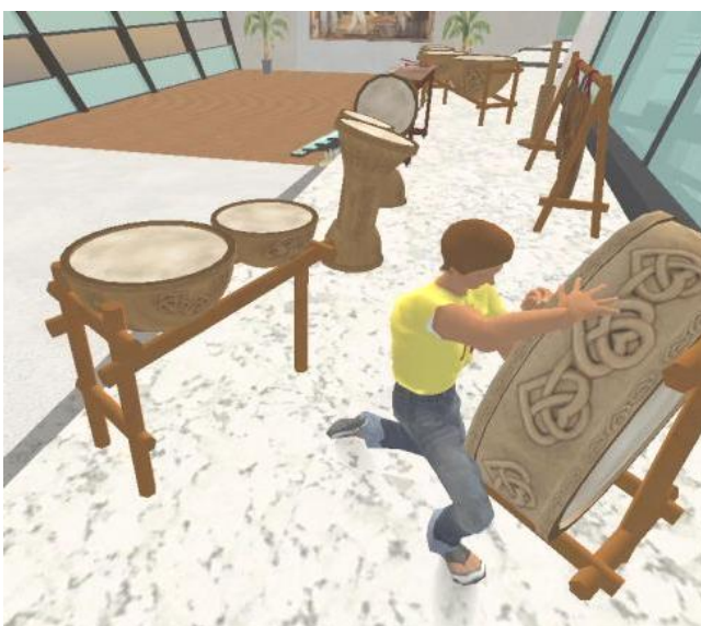
Figure 5. The game's scripting language makes possible interactive tools such as this set of playable musical instruments.

But for educational purposes, innovative new collaborative communication features show the greatest promise for improving on previous game technology. Objects themselves communicate in-game with other objects and/or player avatars as well as connecting with Internet applications outside of SL.