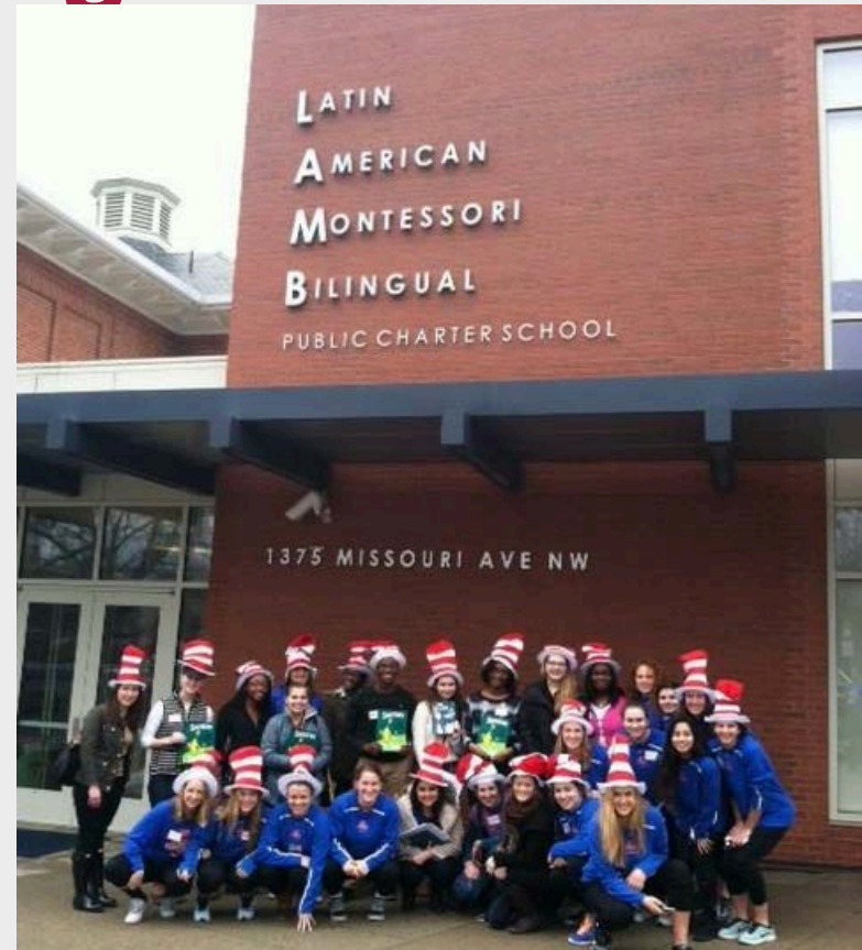
AU CCES Facebook, 2015