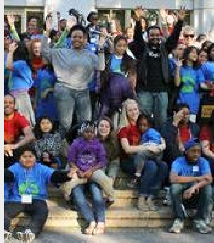
Kids to Campus Day, American University, 2012

http://www.american.edu/communityrelations/May-2012-Newsletter.cfm