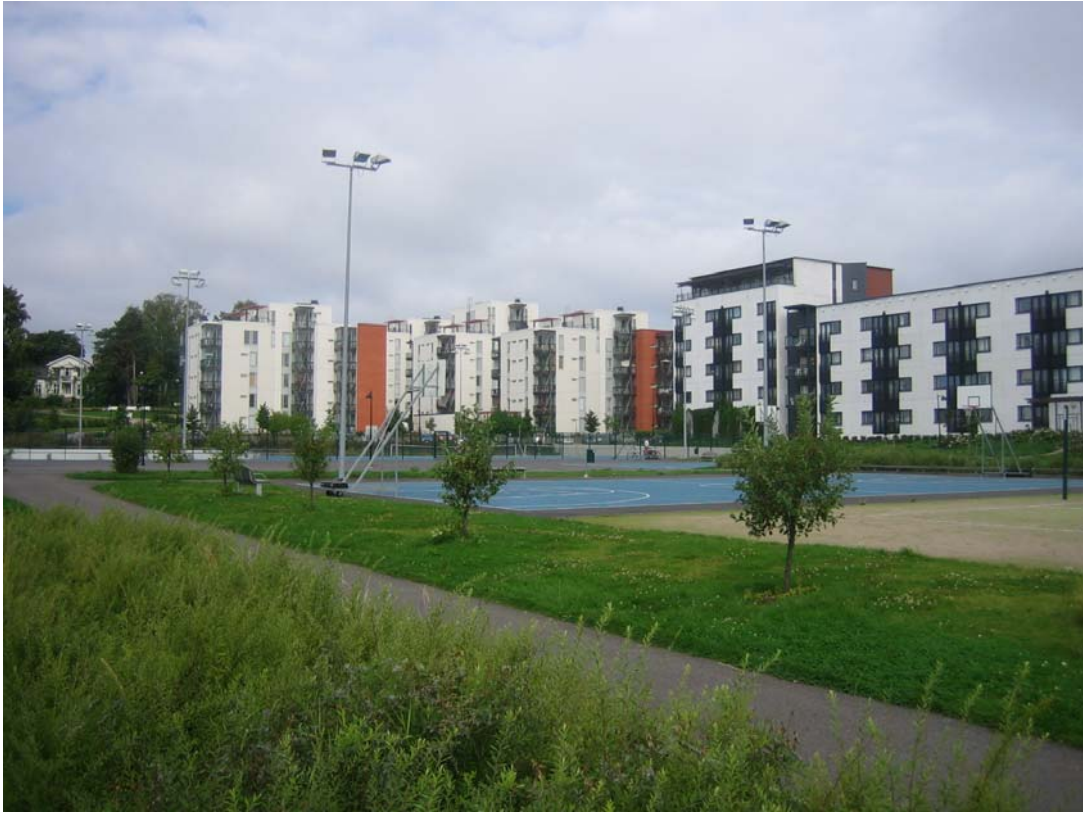
Figure 2: Arabianranta typical apartment block