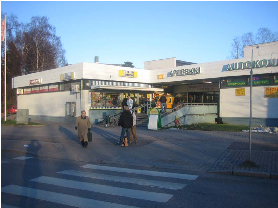
Figure 5: Maunula shopping center

Economically, the main employment clusters in Maunula relate to real estate, home maintenance, services, retail, design and person care (Kurki). The neighborhood also has several key community gathering spaces, including the Saunabaari (senior citizen center), Mediapaja, library, the café across from the Mediapaja, and the recreation center (Saavola).