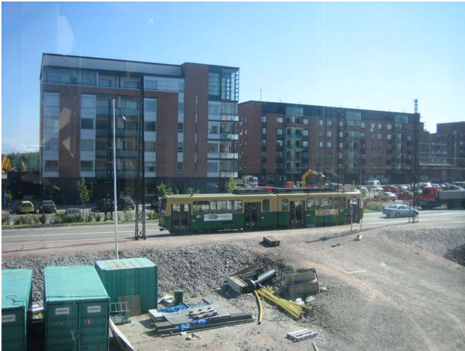
Figure 3: Tram #6 through Arabianranta

Despite being removed from Helsinki's city center, Arabianranta is connected to the City's excellent public transportation network. The City extended tram route #6 to the neighborhood, traveling up Hämeentie, taking a right at Arabiankatu, then ending behind the University of Art and Design Helsinki campus on Arabiankatu. The main bus routes connecting Arabianranta to the city center run through the center of the neighborhood on Hämeentie and along the western edge of the neighborhood on the highway. In addition to connections to the city center, there are several routes which provide connections to the East. Helsinki's subway system includes a station approximately one and a half miles south of Arabianranta at Sörnäinen. The transportation connections make Arabianranta a convenient neighborhood for Helsinki residents who may commute to many different parts of the city. Additionally, the City is seeking to "construct interesting light traffic routes, especially for cyclists, in the shoreline park, and towards the city centre, Pasila, Käpylä and Koskela."