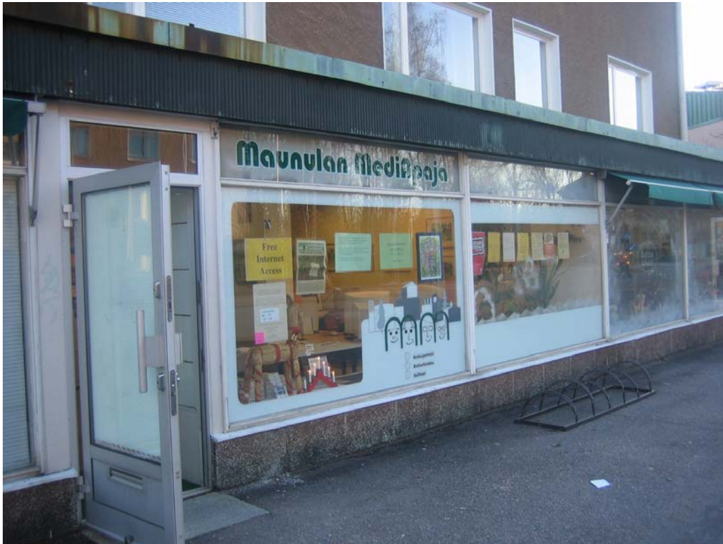
Figure 6: Maunulan Mediapaja