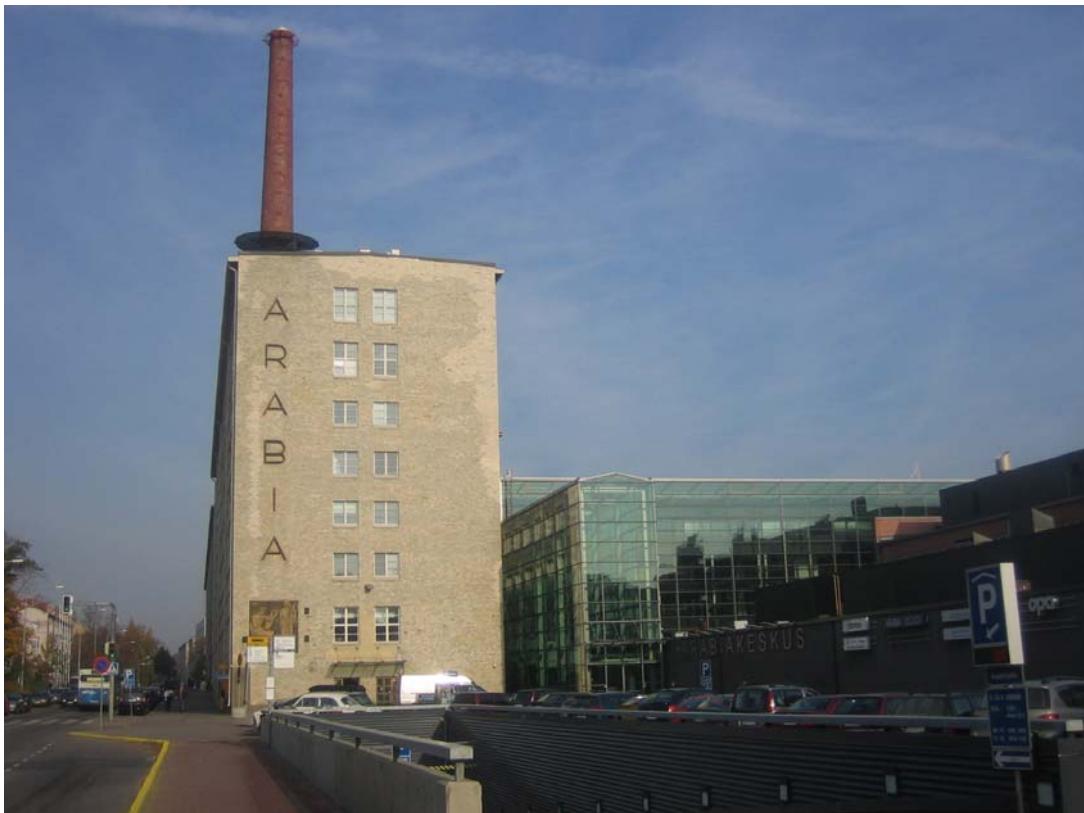
Figure 1: Former Arabia porcelain factory (now University of Art and Design Helsinki)