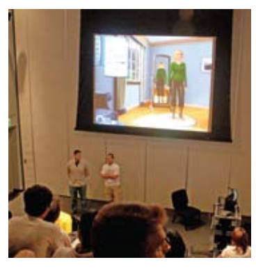
As part of the Alice workshop, students and educators enjoyed a field trip to the global headquarters of Entertainment Arts (EA) in Redwood City, CA.

For two weeks last summer, the School of Engineering hosted workshops for high school teachers and students to learn the popular Alice programming language—an easy-to-use, engaging tool that opens the world of computing to those who might otherwise be intimidated by the necessity to learn intricate code.