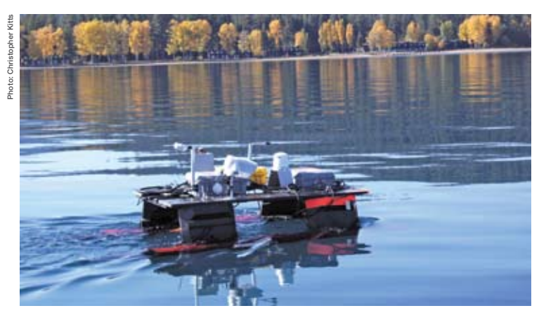
SCU's SWATH boat aids research in Lake Tahoe.