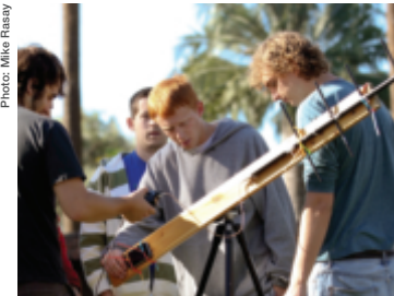
Students test their Innovation Challenge design.