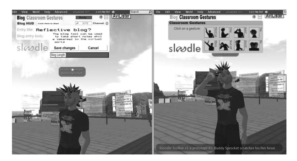
Figure 4. The Sloodle Toolbar acts as a user-interface extension in Second Life, allowing users to write directly to web-logs in Moodle. Additional features of this extensible tool include classroom animations and the ability to match avatars to their corresponding Moodle users.

allows a user to query Moodle for the Moodle identities (if any) of avatars nearby in the 3D virtual space (Figure 4).