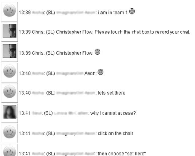
Figure 6. A Second Life chat archive in Moodle supports reflection on and review of class activities – and links Moodle and Second Life identities of participants.

integration of web-based learning support and Second Life. Although the software is still in the early stages of development, a community of educators interested in and using Sloodle to enhance teaching and learning in Second Life is emerging. We are now collecting and evaluating evidence which highlights how Sloodle might be effective in supporting learning and teaching in Second Life – and which is helping to drive the ongoing development of Sloodle itself.