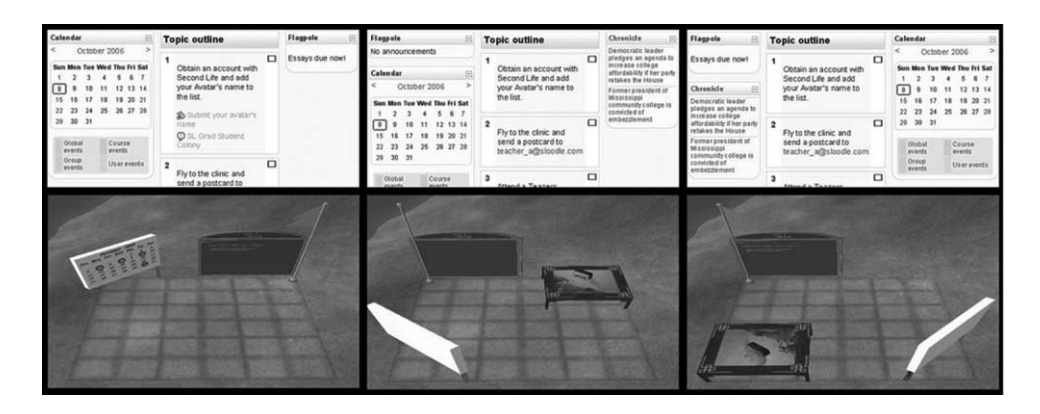
Figure 2. The Sloodle classroom – realising Moodle courses in 3D.

An initial problem to be solved was how to identify the Second Life avatar belonging to a particular Moodle user. So, for example, when a student submits a blog directly from Second Life (see below), the entry needs to be added to Moodle with the student's Moodle