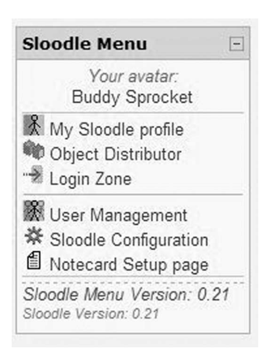
Figure 5. Sloodle menu block. A number of administrative features are available via Moodle – including the ability to send items to avatars inside Second Life without having to log in to the 3D environment