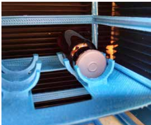
A closer look at the inside of the solar-powered, thermoelectrically cooled unit